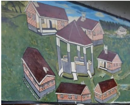
Children's Village Mbingu

Dear friends of the Children's Village, here is the last Mbingu report of the year with best wishes for the new year.