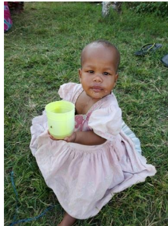
Six children were baptized in Mbingu at the Christmas celebrations