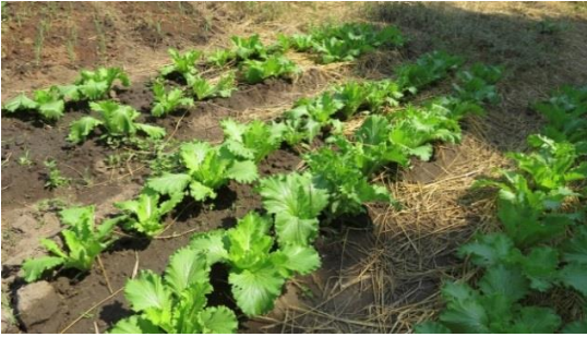
Lettuce and vegetables