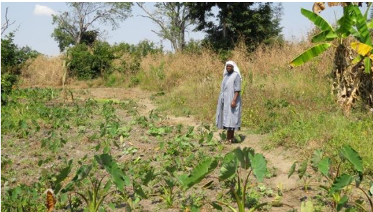
Spinach, onions, garlic