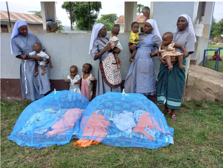
Les 10 plus petits enfants après le repas. Reposez-vous sous la moustiquaire