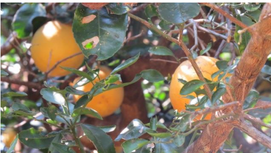
Oranges, grapefruit, lemons, ginger