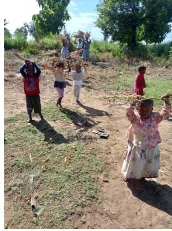
A surplus of nature in the fish pond for the benefit of the children in Mbingu.