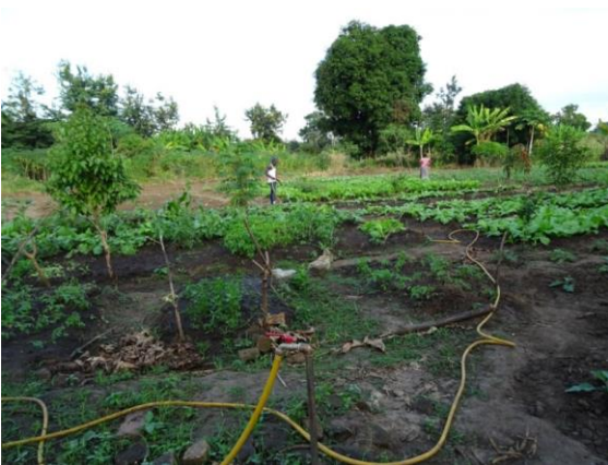
Work in the vegetable garden