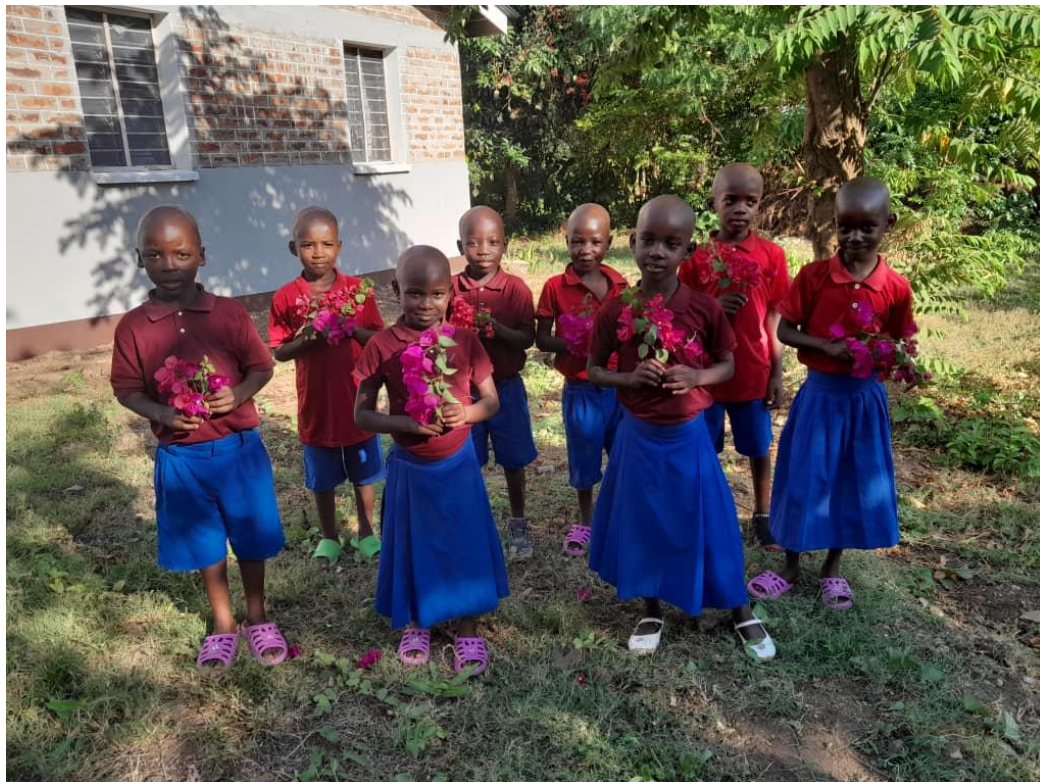
Graduation diploma in the kindergarten